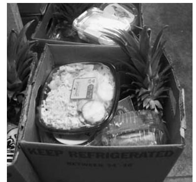
A box of food waiting to be delivered to a needy family.

Any generated profits from the Thrift Store supports all GSM Care Ministries.