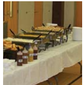
Food catered by Sims Bar-B-Que, Duncan